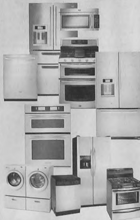
In-Store Financing Available. See store for Details.

VISIT OUR SHOWROOM. Ask us about our Bundle Package Discounts.