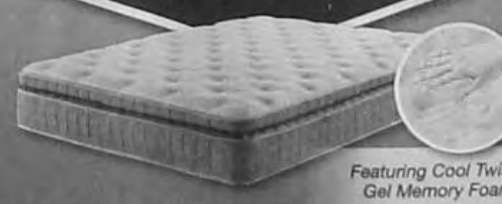
Featuring Cool Twist™ Gel Memory Foam