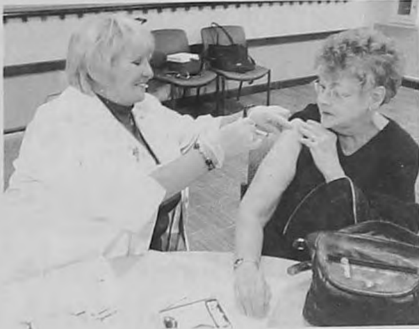
The best way to protect yourself from the flu is to get vaccinated.

State health officials are saying similar things, with the Michigan Department of Community Health releasing data showing about 185 people across the state were hospitalized in six hospitals with the flu or flu-like symptoms as of Dec.