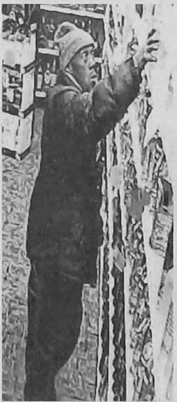
CANTON POLICE Police are seeking the identity of this man, wanted after five bottles of liquor were stolen from Holiday Market in Canton.

A suspect is being sought after Canton police say he stole five bottles of liquor by concealing them in his jacket at the Holiday Market in Canton, on Lilley south of Cherry Hill. Police released surveillance photos of the suspect and are asking anyone who can identify him to call the Canton Police Department at 734-394-5400. Callers may remain anonymous. Police said the incident happened Dec. 22.