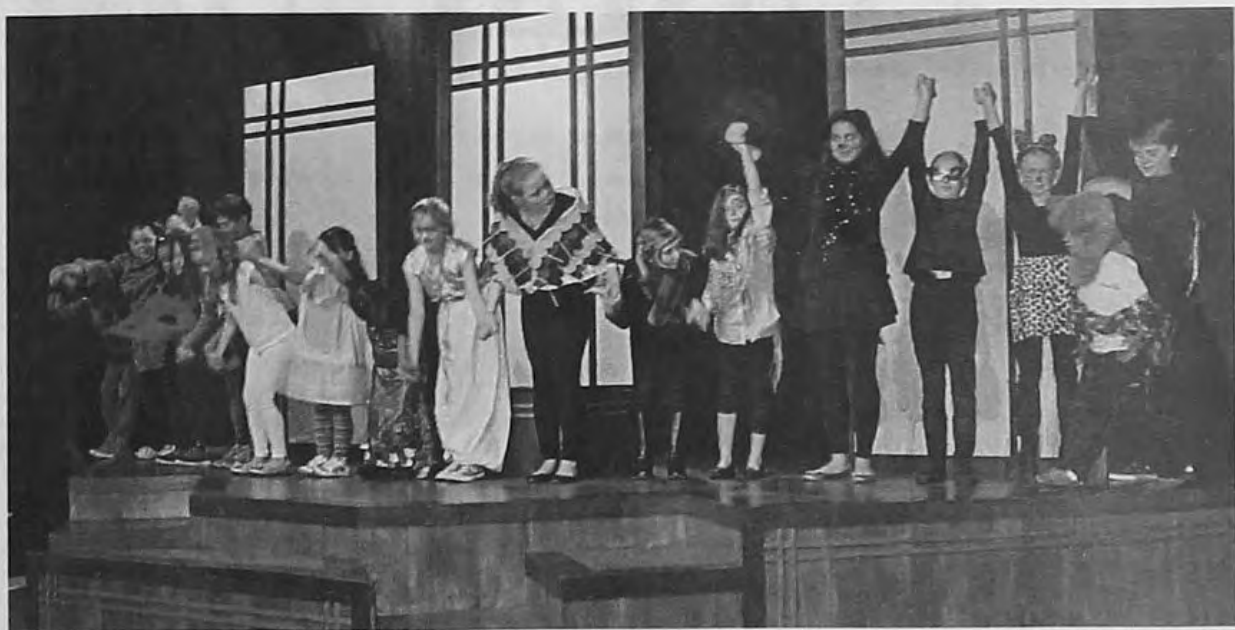
PLYMOUTH UPTOWN PLAYERS

The program costs $200 per actor for the season, with a current PCAC student membership required ($30 per year). Actors may pre-register online, by phone or in person on the day of auditions. Online registration and payment option can be accessed through the website, www.plymoutharts.com . The PCAC has office hours from 9 a.m. to 4 p.m. Monday through Thursday.