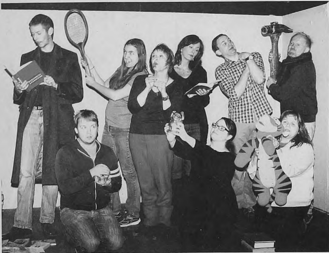
The cast of Cure for the Wintertime Blues will play improv games and act out comedy sketches Saturday, Jan. 17, in Plymouth.