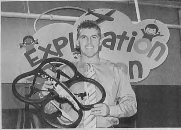
YANKEE AIR MUSEUM

The Yankee Air Museum is dismantling its Mars Rover Exploration Station making way for its next big attraction: Fly Zone. The Exploration Station is the museum's area for providing kids with interesting and challenging hands-on educational activities.